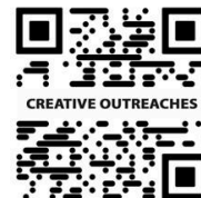
200 Creative Outreach Ideas