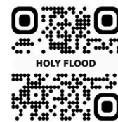
Holy Flood Playbook