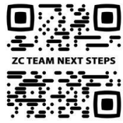
Z.C. Team: Next Steps