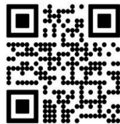
Register Your Creative Outreaches