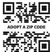
Adopt a Zip Code & Select a Role

Let's plan, build, and run together for a powerful and anointed summer of saturation and transformation!